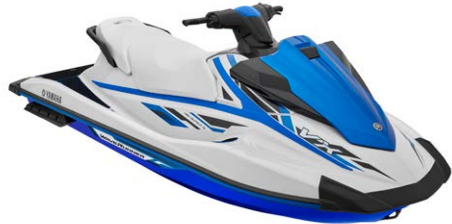
White with Azure Blue