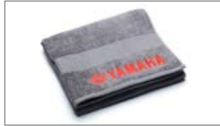
Grey Bath Towel N18-GR012-F0-00