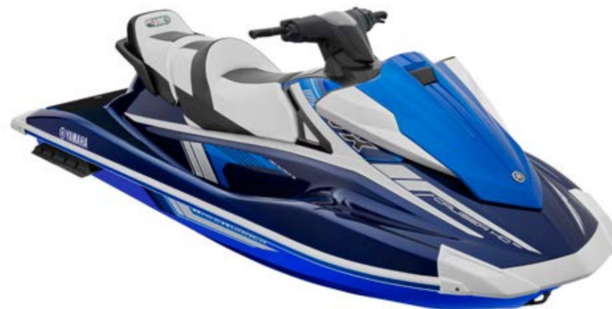
Yacht Blue with Azure Blue