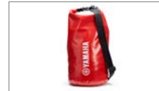
BIG RED DRY BAG T18-HD009-C0-00