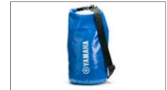
BIG BLUE DRY BAG T18-HD009-E0-00