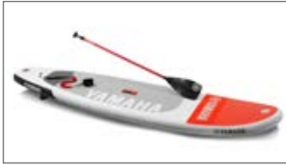
INFLATABLE STAND UP PADDLEBOARD YMM-H17SU-PP-C3