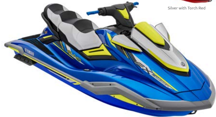
Azure Blue with Lime Yellow