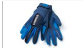
WaveRunner RACE GLOVES D17-AN103-E0 1S-0S-0M-0L-1L-2L