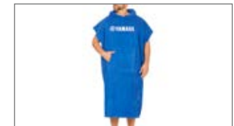
Adults Poncho Towel N18-HR313-E0-00 one size