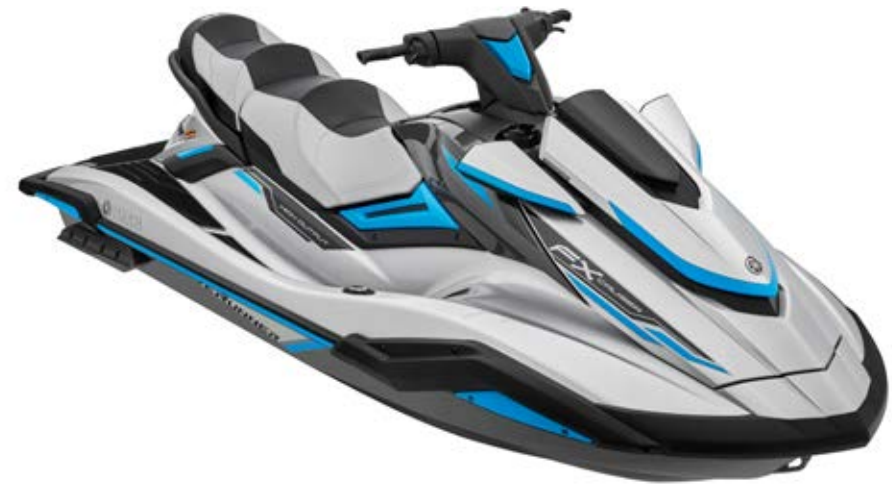
Silver with Carbon