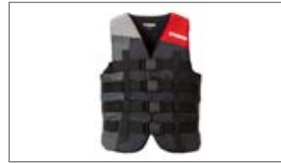
WaveRunner 4 BUCKLE LIFE VEST D18-AJ314-B7 1S-0S-0M-0L-1L-2L-3L