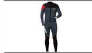
WaveRunner MEN'S LONG JOHN JACKET D18-AL102-B7 0S-0M-0L-1L-2L-3L