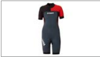
WaveRunner WOMEN'S SHORTY D18-AL203-B7 0S-0M-0L-1L