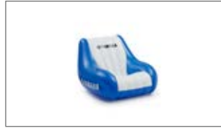
INFLATABLE CHAIR BLUE N18-GN019-E0-00