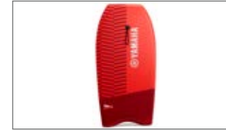
BODYBOARD RED N18-GN021-C0-00