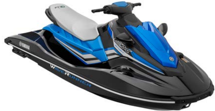
Black with Azure Blue

It has our famously smooth, reliable, economical power, plus everything needed to get you on the water in style - clear informative instrumentation, mechanical reverse, dual mirrors, re-boarding step and handle, a tow hook and generous storage