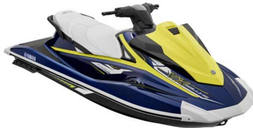
Yacht Blue with Lime Yellow