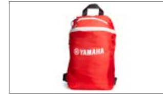
PACKABLE BACKPACK T18-HB00C-01-00