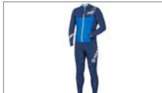
WaveRunner RACE MEN'S LONG JOHN WETSUIT D17-AL1E0-E0 0S-0M-0L-1L-2L-3L