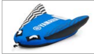
WING TUBE 1P BLUE N18-GN016-E0-00