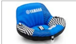
TOWABLE CHAIR 2P BLUE N18-GN017-E0-00