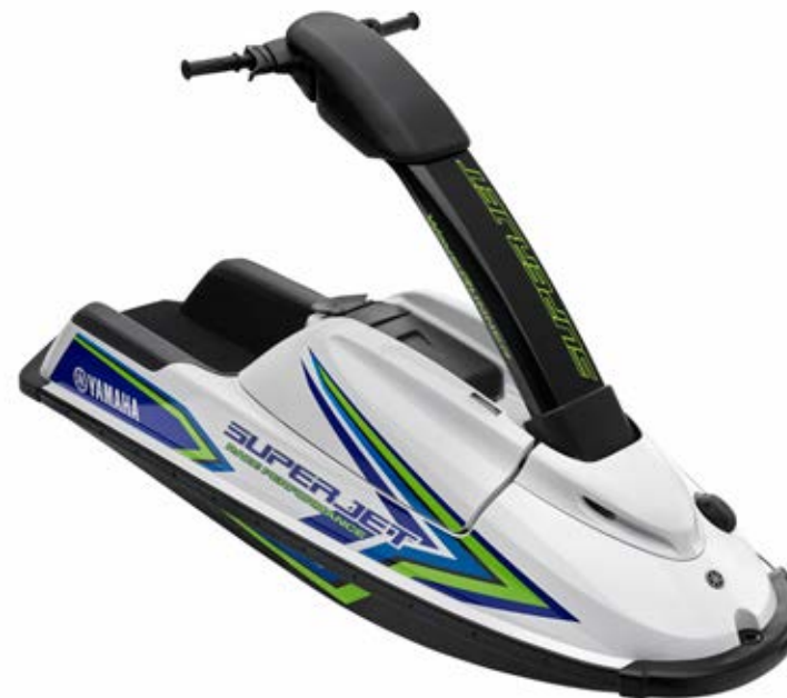
White with Blue

Its unique ergonomic design - with spring-assisted steering pole and handlebar - leads the rider naturally into a comfortable lean-forward position, the ideal stance for competition riding. Your SuperJet is ready and waiting. But please be aware that it is sold for closed course and competition use only.