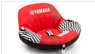
TOWABLE CHAIR 2P RED N18-GN017-C0-00