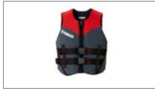
WaveRunner WOMEN'S FRONT ENTRY VEST D18-AJZ14-B7 0S-0M-0L-1L-2L