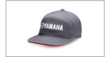
WaveRunner CAP GREY N18-GH100-F0