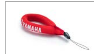
Floating Key Ring N18-NL003-C5-00