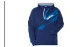
WaveRunner RACE HOODY K17-AT106-E4 1S-0S-0M-0L-1L-2L-3L