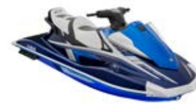
VX Cruiser HO