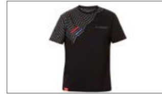
WaveRunner T-SHIRT B18-GT101-B0 1S-0S-0M-0L-1L-2L-3L