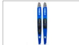
WATERSKI BLUE N18-GN018-E0-00