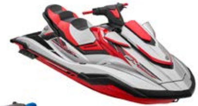
Silver with Torch Red