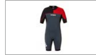
WaveRunner MEN'S SHORTY D18-AL103-B7 0S-0M-0L-1L-2L