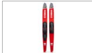
WATERSKI RED N18-GN018-C0-00