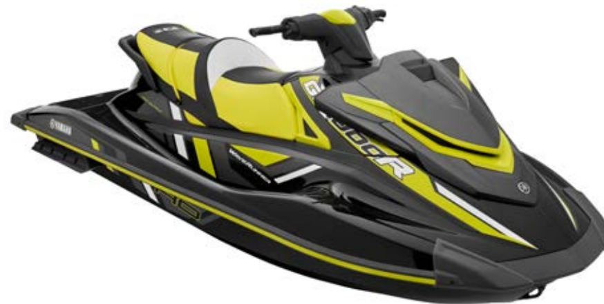
Black with Carbon