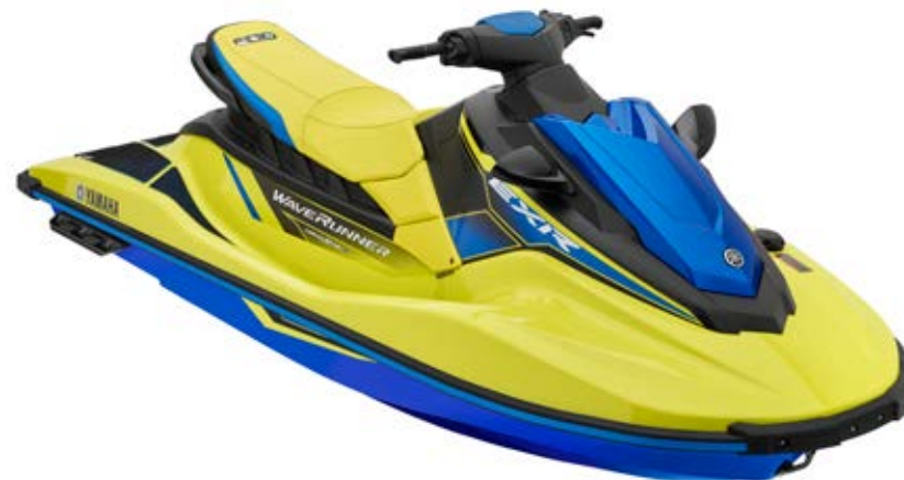
Lime Yellow with Azure Blue