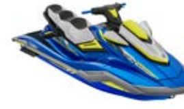
FX Cruiser SVHO