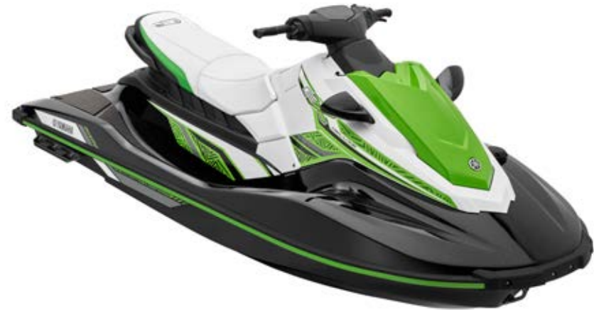
Black with Lime Green