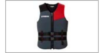
WaveRunner MEN'S FRONT ENTRY VEST D18-AJ114-B7 0S-0M-0L-1L-2L