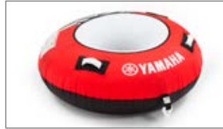
FUNTUBE 1P RED N18-GN012-C0-00