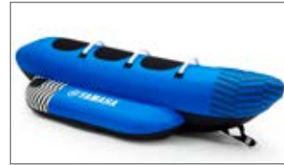
SHUTTLE 3P BLUE N18-GN015-E0-00