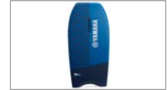
BODYBOARD BLUE N18-GN021-E0-00