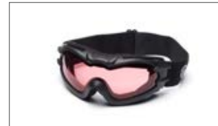
WaveRunner RACE GOGGLES PINK VISOR N17-AV004-B7-00