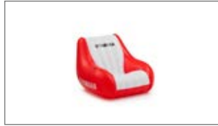
INFLATABLE CHAIR RED N18-GN019-C0-00