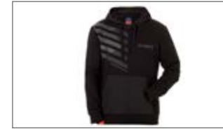
WaveRunner HOODY B18-GT107-B0 1S-0S-0M-0L-1L-2L-3L