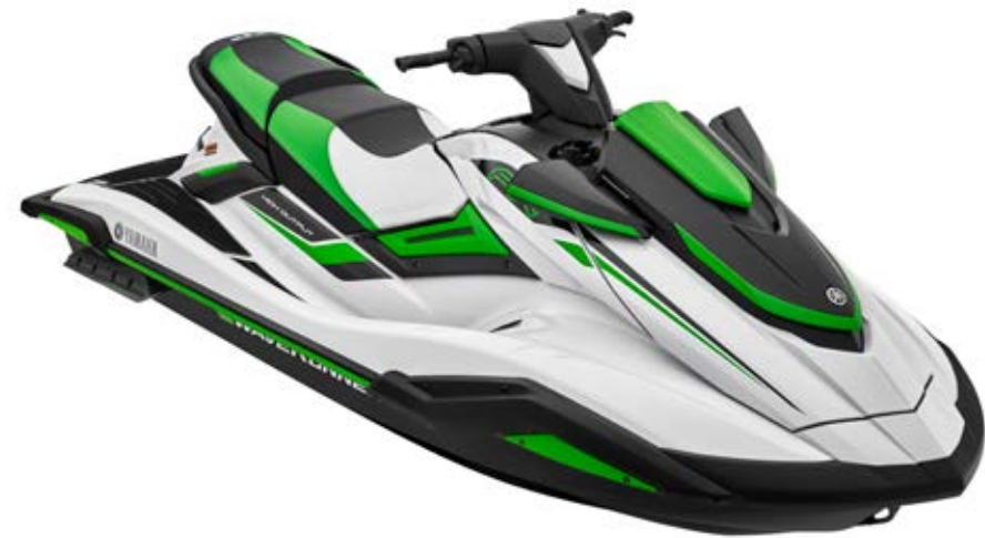
White with Green