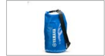
SMALL BLUE DRY BAG T18-HD010-E0-00