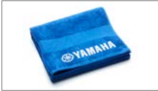
Blue Bath Towel N18-GR012-E0-00