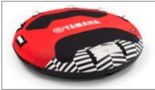
DECK TUBE 2P RED N18-GN014-C0-00