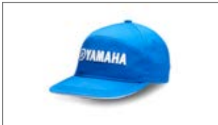
WaveRunner CAP BLUE N18-GH100-E0