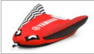
WING TUBE 1P RED N18-GMP16-C0-00