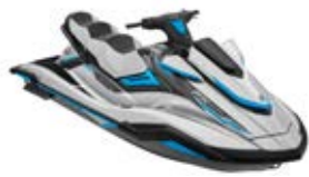
FX Cruiser HO