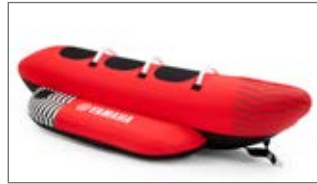
SHUTTLE 3P RED N18-GN015-C0-00