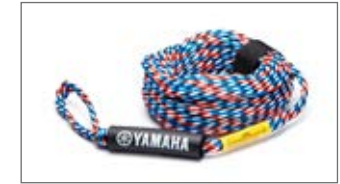
TOW ROPE 4P N18-GN013-C4-00