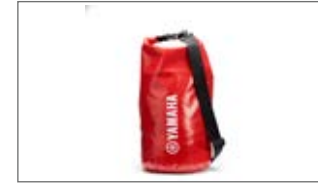
SMALL RED DRY BAG T18-HD010-C0-00