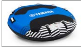
DECK TUBE 2P BLUE N18-GN014-E0-00