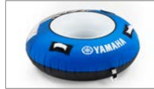
FUNTUBE 1P BLUE N18-GN012-E0-00